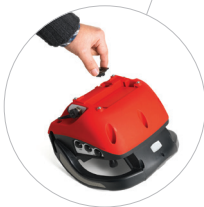
External removable EEPROM SIM module